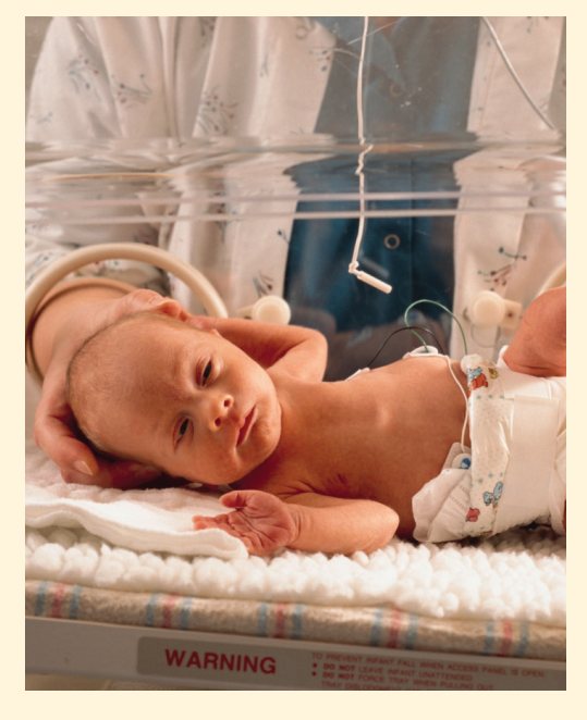
Smoking during pregnancy can cause your baby to be born too early and have low birth weight. If you smoke, your baby is more likely to become sick or die.

• For children with asthma, breathing secondhand smoke can trigger an attack. The attack can be severe enough to send a child to the hospital. Sometimes an asthma attack is so severe that a child dies.