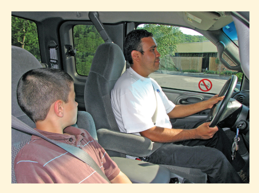
Our children are so important that we should ask family members and visitors not to smoke around them.

In Your Car. Do not allow anyone to smoke if children are riding in your car. Rolling down a window does not protect them.