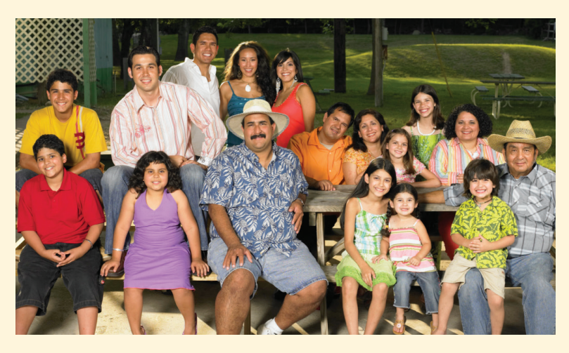
Hispanic adults smoke less than most other groups in the United States. But our teens need our help to choose good health and not start smoking.